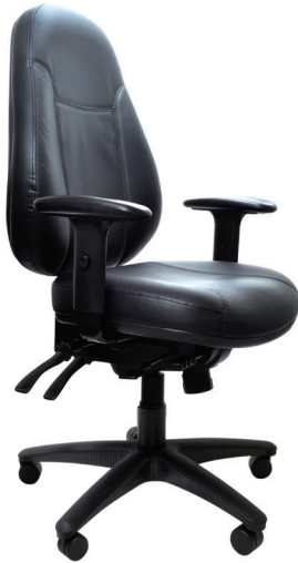
Buro Persona 24/7 - Leather Seated