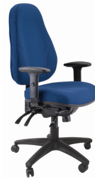
Buro Persona 24/7 - Navy Blue Fabric