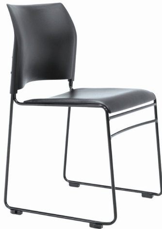
Maxim Black - Black Powder Coat Frame