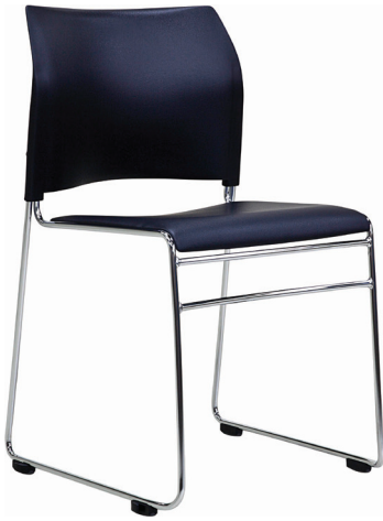
Maxim Black - Chrome Frame