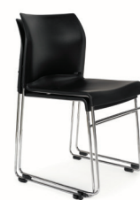
Envy stacked, black