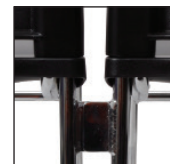
Envy with heavy-duty linking system (Indent only)