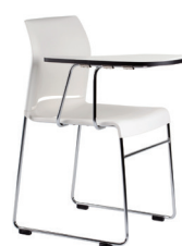
Envy with Tablet, white (Indent only)